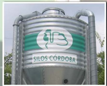
pneumatic fill kit