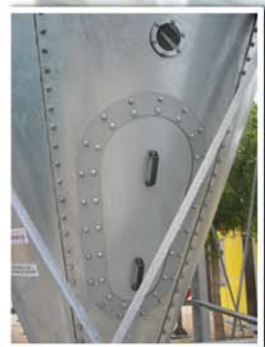
hopper cleaning door