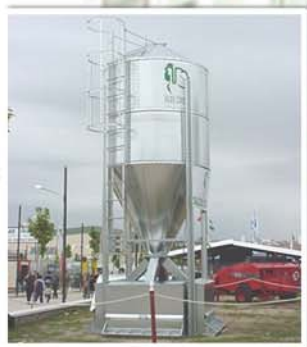
optional flat metal sheet