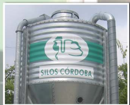
pneumatic fill kit