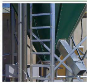
addit. discharge in hopper pipe type